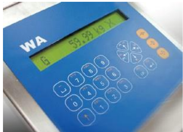
The information is inputted with a 21-key membrane keypad

To ensure the traceability, to the log memory is saved each weighing, tare weight, weighing number, time and date. Additionally, an optional text section can be configured for